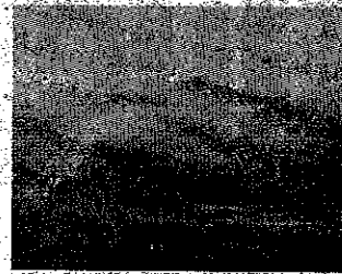
INQUIRY: The cause of the Wingfield fire is unknown.

Calls have been made for the EPA to be given more